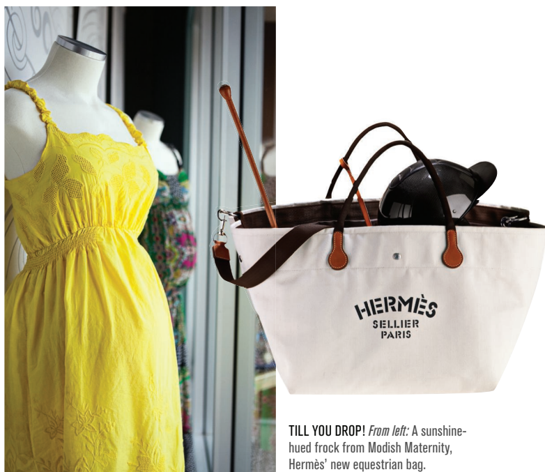
TILL YOU DROP! From left: A sunshine-hued frock from Modish Maternity, Hermès' new equestrian bag.